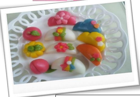
Mostly Songpyeon's shapes look like a half moon, but people make them into a lot of different shapes.